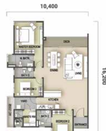
LAYOUT PLAN - TYPE B (1,565 SQ. FT.)

(3 Bedrooms) Unit No. 2, 3, 6, 7, 10, 11, 12, 13, 13A, 15