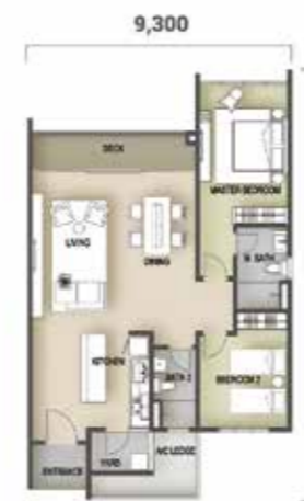
LAYOUT PLAN - TYPE E (1,208 SQ. FT.)