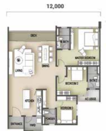
LAYOUT PLAN - TYPE A (1,494 SQ. FT.)

(3 Bedrooms) Unit No. 2, 3, 6, 7, 10, 11, 12, 13, 13A, 15