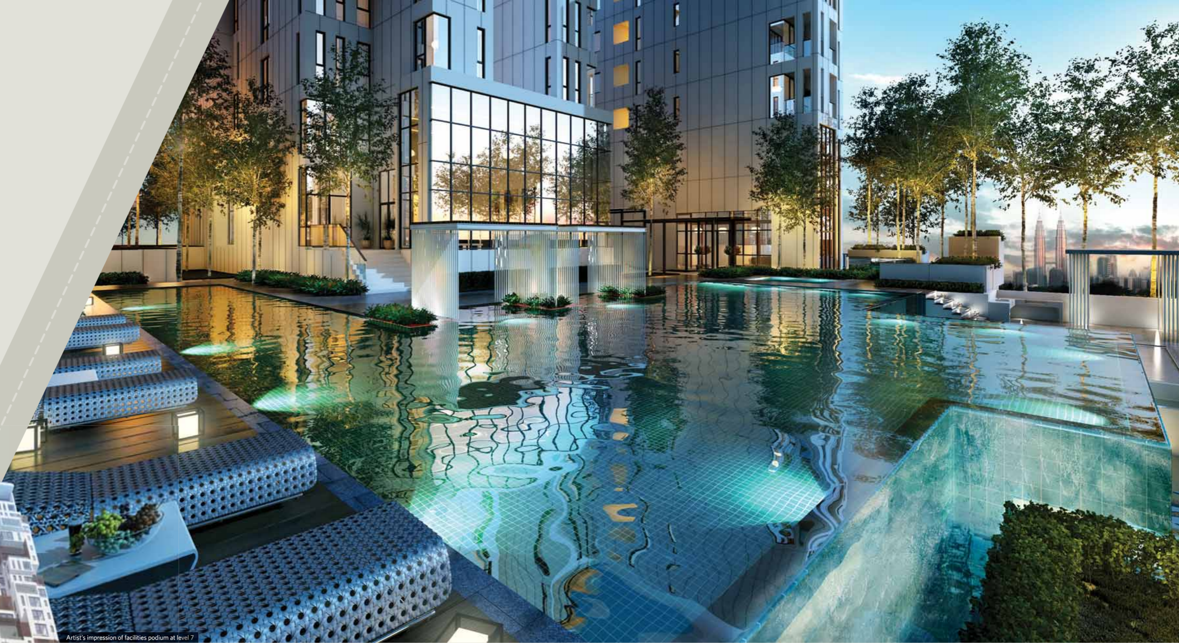
Artist's impression of facilities podium at level 7

Privacy and serenity for dwellings at level 7 are retained by elevating these units by appoximately 6ft above ground and screened by spacious private garden terraces allotted individually to these units.