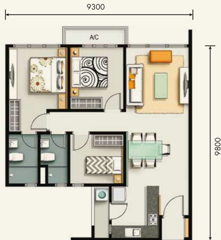
TYPE ..... B 1,000 SQ.FT. 4-BEDROOMS