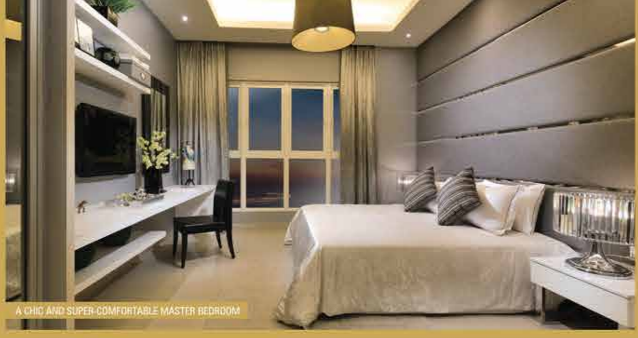
A CHIC AND SUPER-COMFORTABLE MASTER BEDROOM