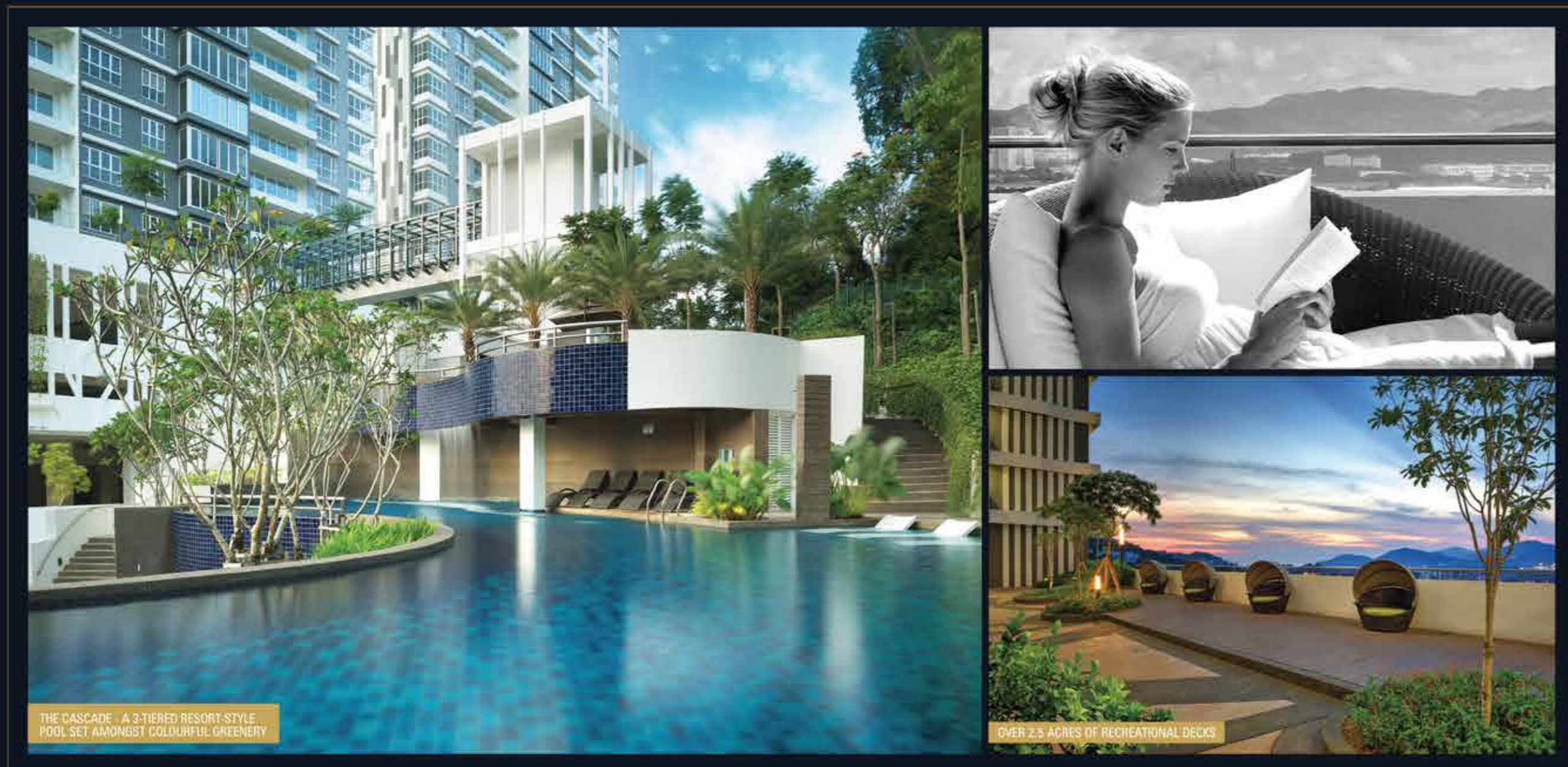
THE CASCADE - A 3-TIERED RESORT-STYLE POOL SET AMONGST COLOURFUL GREENERY