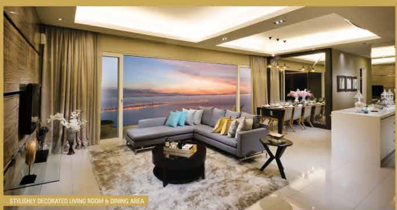
STYLISHLY DECORATED LIVING ROOM & DINING AREA

Experience the pinnacle of exclusivity with only three residential units per level. Crowned with high ceilings, unencumbered spaciousness fills the entire abode. The picturesque coastline flows seamlessly indoors through full-length windows to create a spectacular living mural. Utmost privacy can be found in its exquisitely adorned bedrooms that also offer a therapeutic sea view. Your home holds as perfect space for any occasion - from deep rejuvenation to lively merry-making.