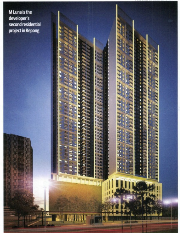
M Luna is the developer's second residential project in Kepong

This includes the paint, which will have low volatile organic compounds (VOCs) and will be used in all units. According to the US Environmental