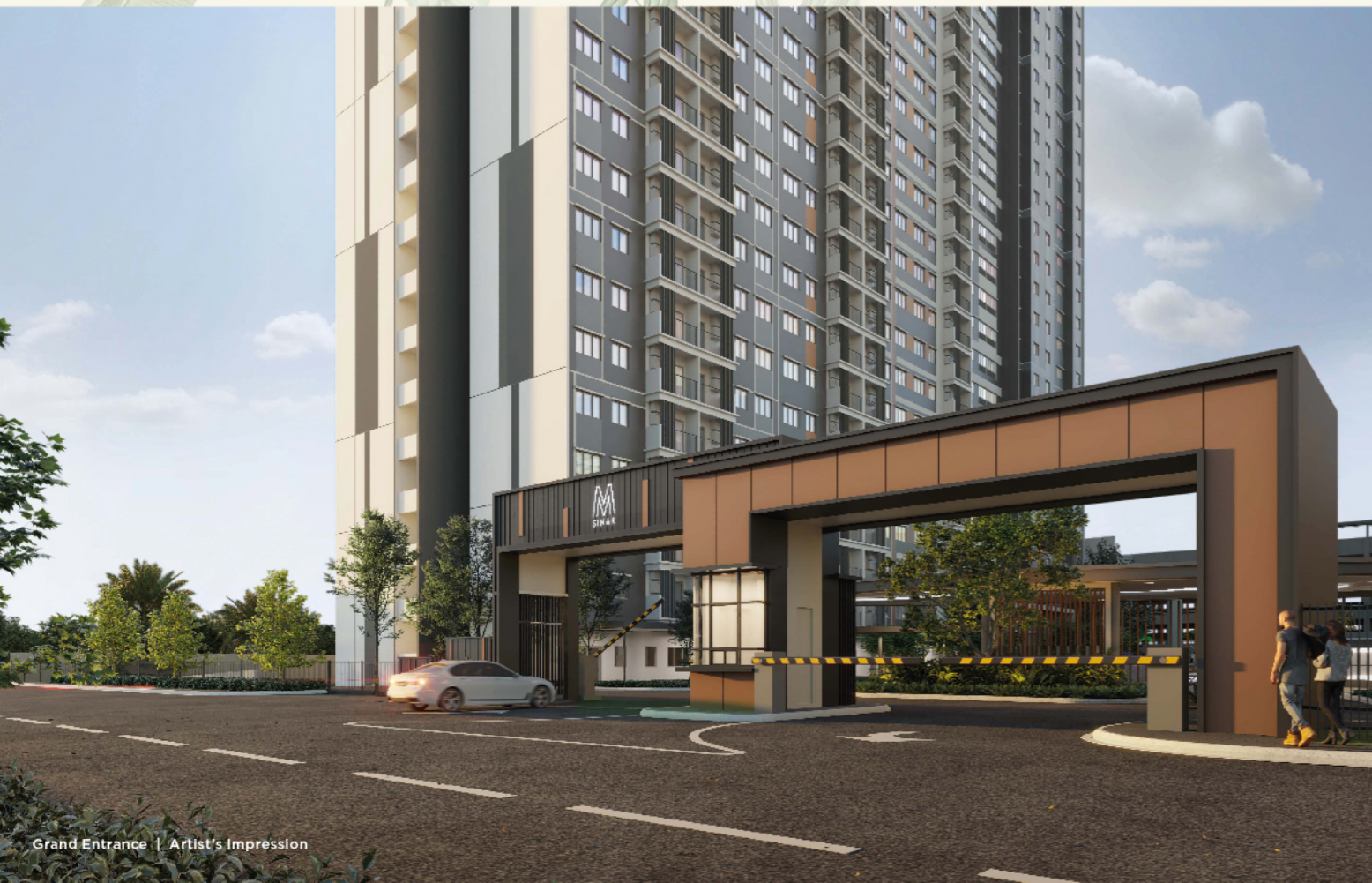
Grand Entrance | Artist's Impression