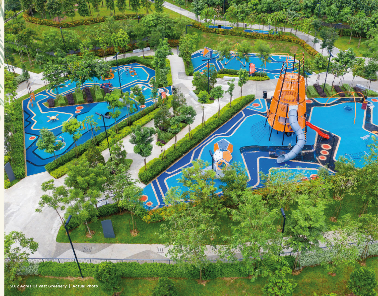
9.62 Acres Of Vast Greenery | Actual Photo