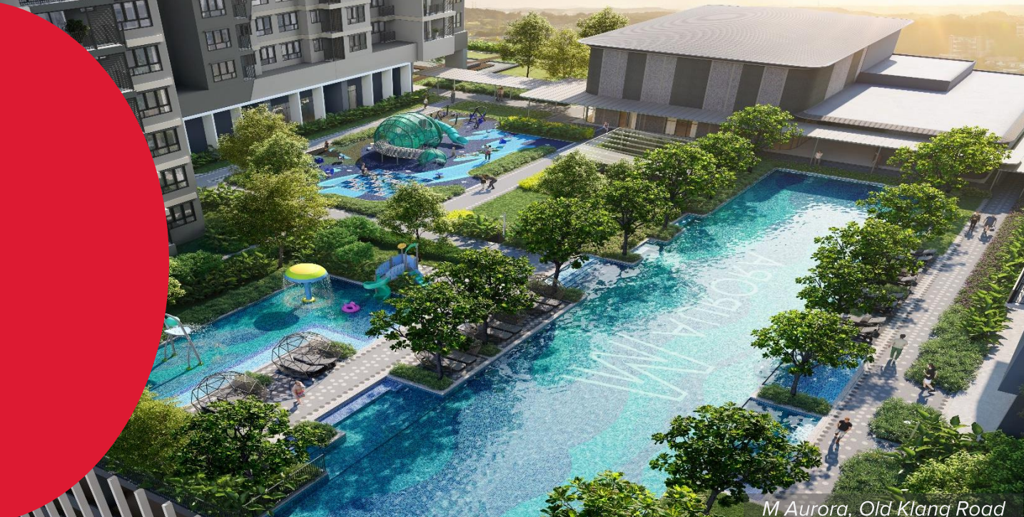
M Aurora, Old Klang Road